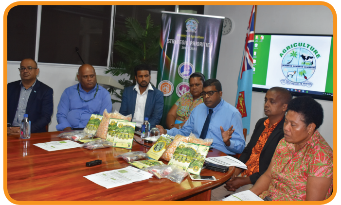
Ministry launches home gardening package assistance for its COVID-19 response efforts.