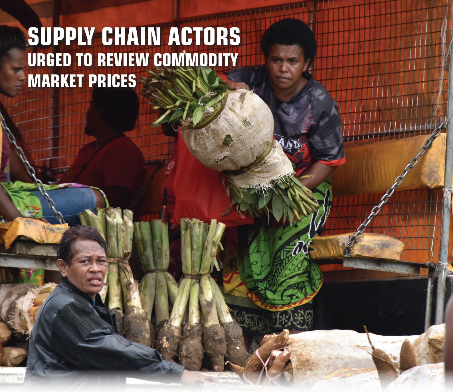
Farmers from Naitasiri unloading their crops to sell during the COVID-19 Lockdown at the Dilkusha checkpoint.

The Ministry of Agriculture urged all who are in the market supply chain to consider the impact of COVID-19 on all Fijian households and to refrain from unnecessarily marking up the prices of basic food items such as crops and vegetables.