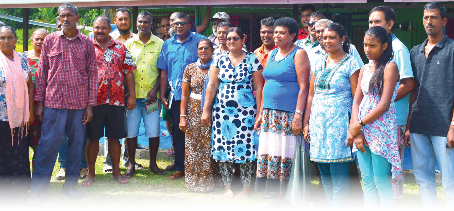
Minister for Agriculture - Hon. Dr. Mahendra Reddy (5th from left) with farmers at Barara flats Sabeto, Nadi.

The strategic advantages within Fiji's agriculture sector need to be taken advantage of to ensure continued growth.