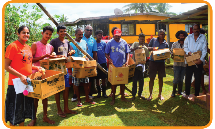
Households in Baulevu receive day-old-chicks from MoA (chicks were donated by Pacific Feeds)