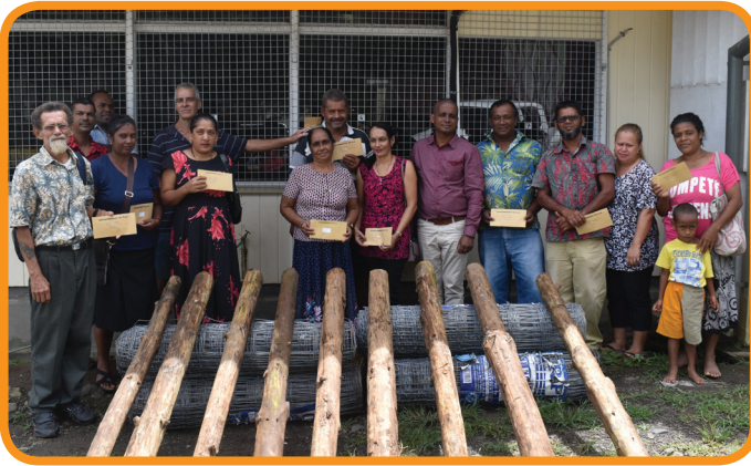
Farmers in Cakaudrove receive fencing materials from MoA