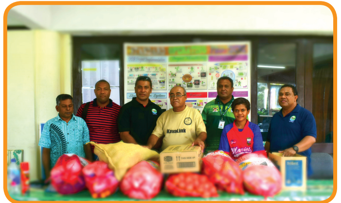
Senior officials donate food rations to staff affected by TC Harold.