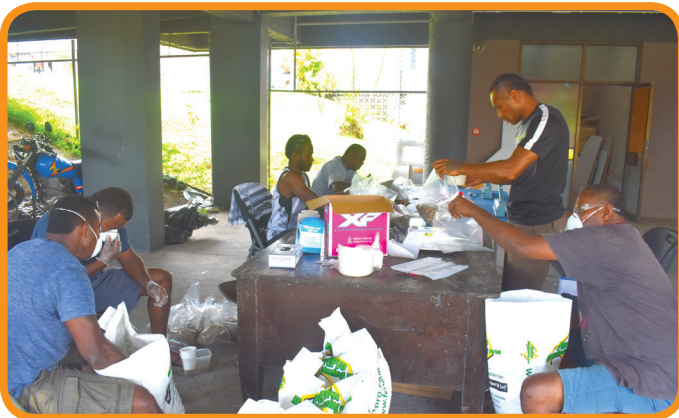
Seed packing team at the Raiwaqa basement.