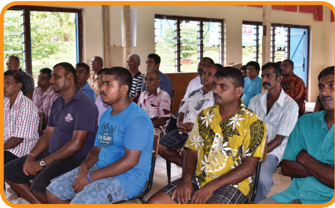
Farmers in Vunivau turn up in numbers to receive fencing materials from MoA.