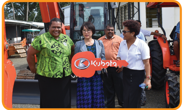
Ministry receives Kubota tractors from Indonesian Government.