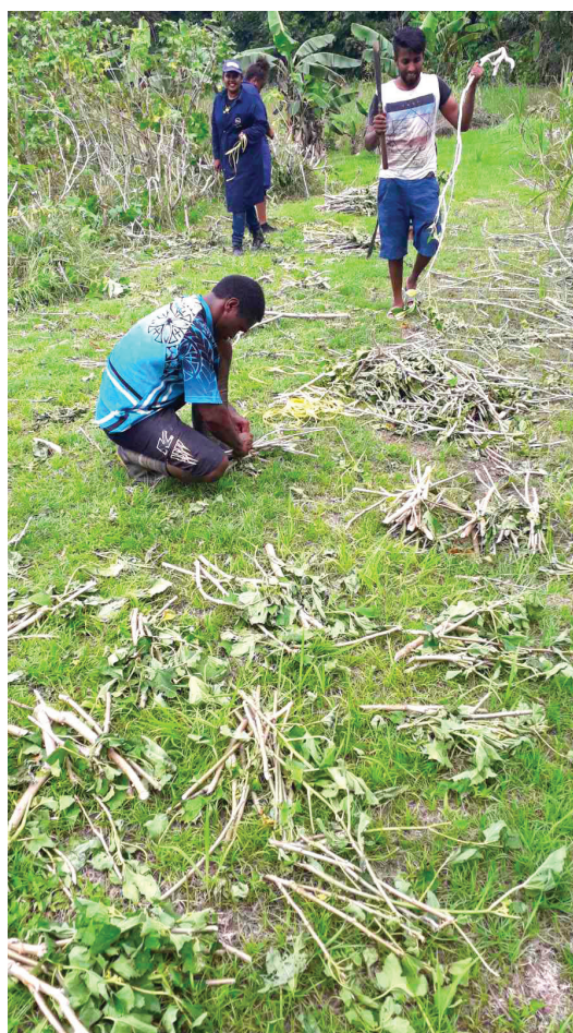
MoA staff preparing bele cuttings for Vanua Levu

The Minister said the support would continue for the next four months to prioritized farming households in Cakaudrove, Bua, Macuata, Southern and Northern Lau, and Lomaiviti.