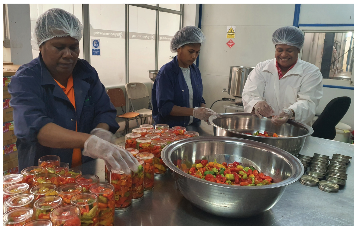
AMA staff packing chillies.

The Agricultural Marketing Authority (AMA) trading as Fiji Agro Marketing has received reaccreditation of the internal Hazard Analysis Critical Control Point (HACCP) standard this year. Fiji Agro Marketing got HACCP accredited for the first time in early 2020, following an audit done in late 2019.