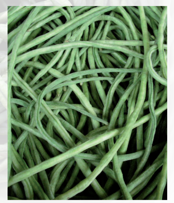
Yard Long - Dark green variety