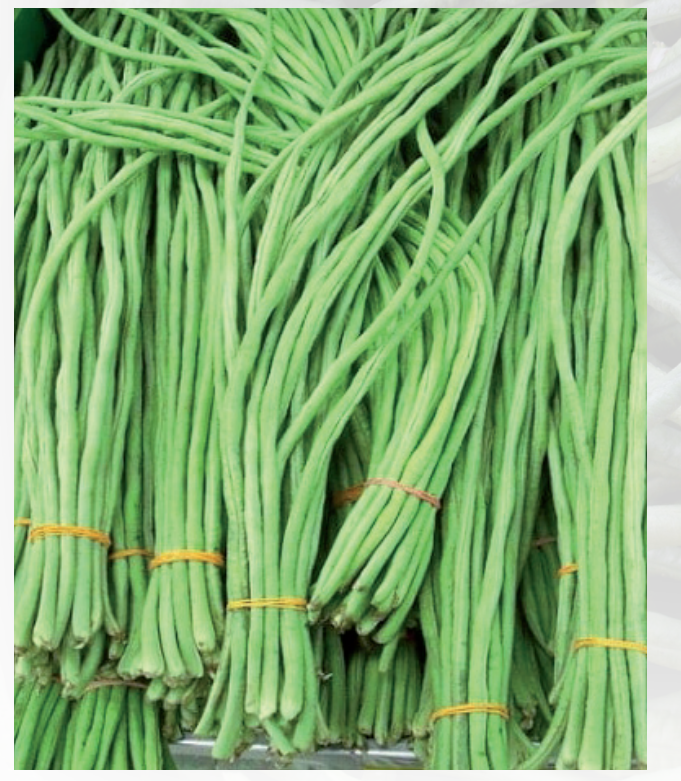
Yard Long - Light green variety