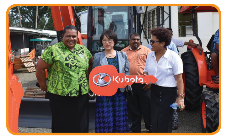
Ministry receives Kubota tractors from Indonesian Government.