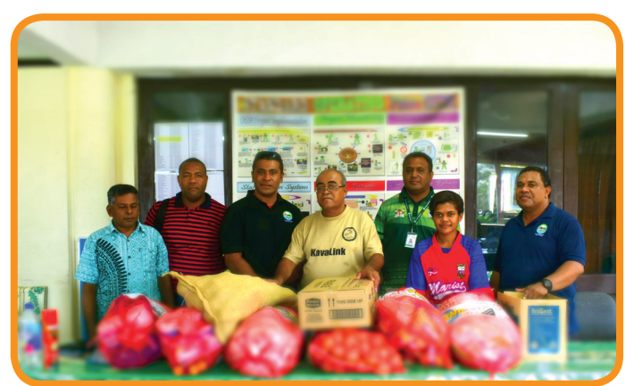
Senior officials donate food rations to staff affected by TC Harold.