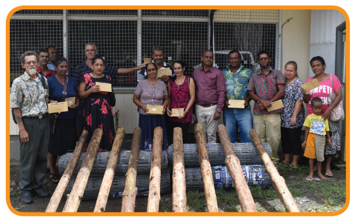
Farmers in Cakaudrove receive fencing materials from MoA