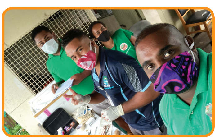
Stray Dog trap-neuter-release 1 week campaign in Savusavu with the locality staff in mid-May.