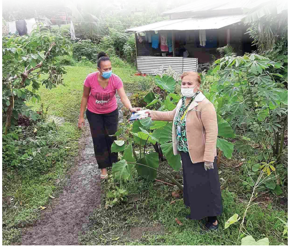
Seed distribution to homes around Suva corrido

11,000 Fijian households have received the seed packages distributed by the Ministry of Agriculture since the exercise began early May.