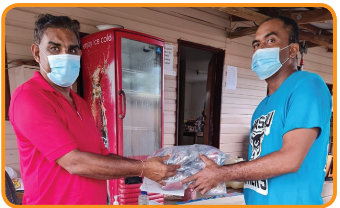
Seed distribution to Community Leaders.