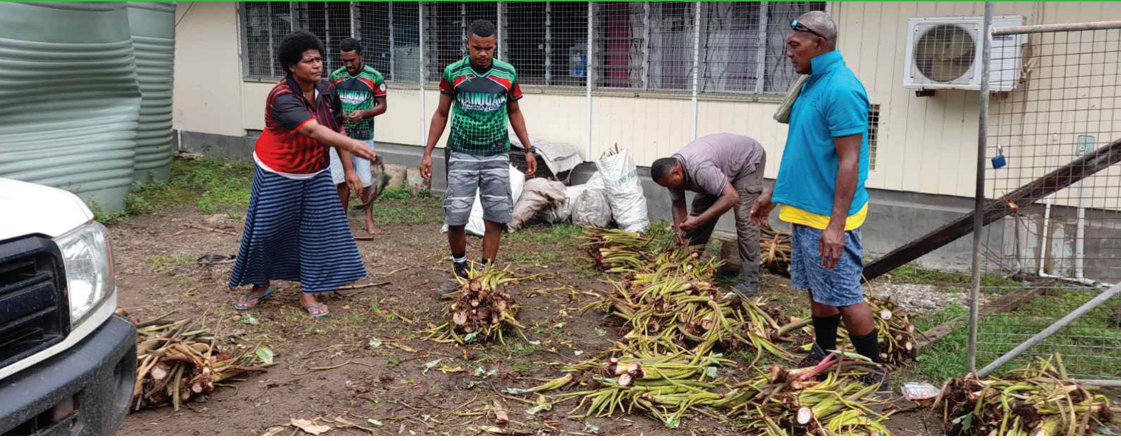
MoA staff in the North working on planting materials for distribution to farmers affected by TC Yasa and Ana.

Almost 7,500 farmers in Vanua Levu have been assisted with kumala and yaqona cuttings and dalo suckers.