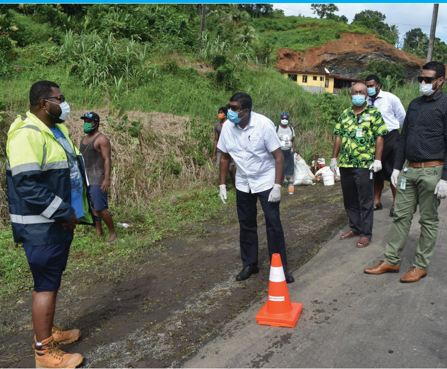
through checkpoints to various markets adhering to the COVID border transaction protocol.