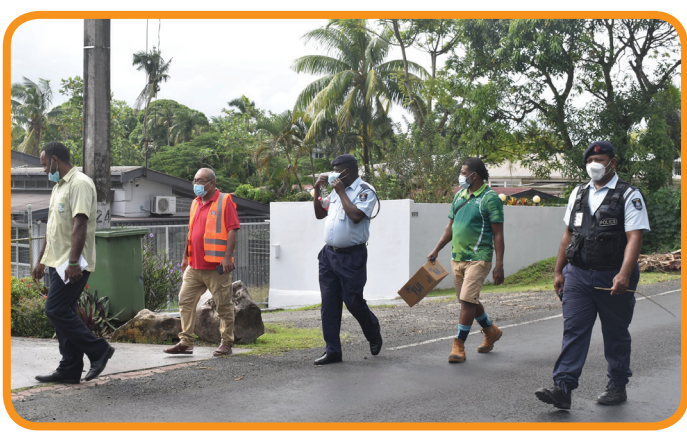
Seed distribution by MoA staff with assistance from Fiji Police Officials.