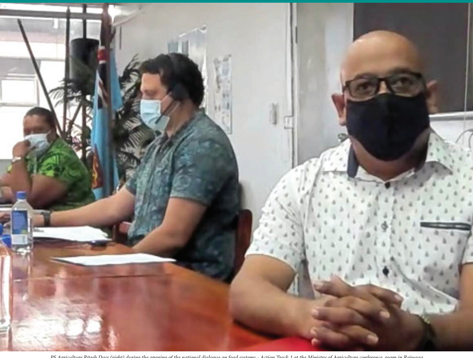
PS Agriculture Ritesh Dass (right) during the opening of the national dialogue on food systems - Action Track 1 at the Ministry of Agriculture conference room in Raiwaqa.

Fiji had a series of national dialogues on food systems ahead of the United Nations Food Systems Summit (UNFSS) taking place in September 2021.