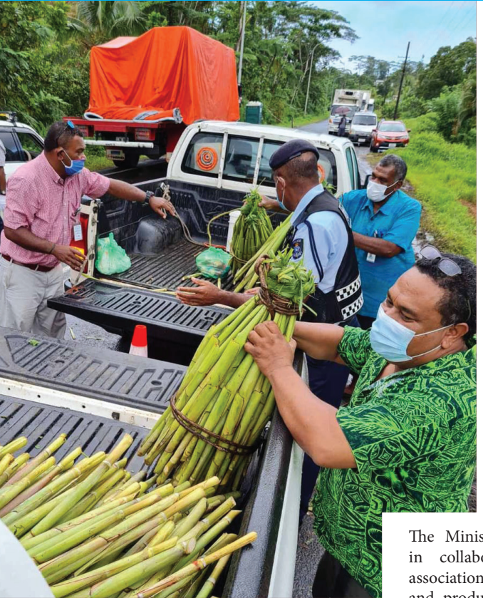
The Ministry of Agriculture was working in collaboration with farmers, vendors association, municipal councils, middlemen, and producers in facilitating farm produce