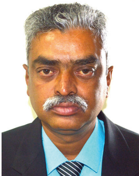
Assistant Minister for Agriculture-Hon Viam Pillay

Christmas is a time of great joy in Fiji as we come together in our different religious beliefs as a Ministry to celebrate the birth of Jesus Christ. We come together partly because of the wonderful simplicity of the Christmas message - a baby born to a poor couple in a stable who grew up to change the world.