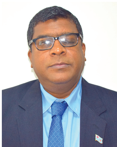
Minister for Agriculture, Waterways and Environment - Hon. Dr. Mahendra Reddy.

towards delivering our core role for our clientele and partners.