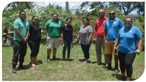
Team ADRA and MoA Staff for C4C monitoring.