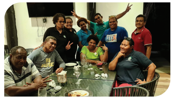
SAO NN & team hosts Information Team for dinner