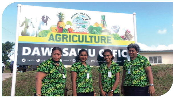
Central staff pose for a photo at Dawasamu Agriculture Station.