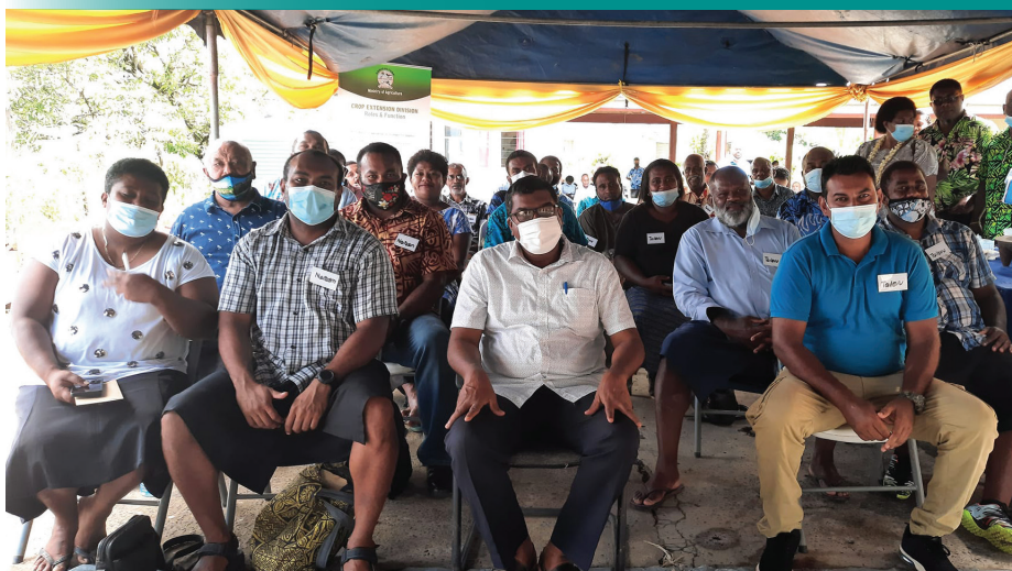
Hon. Dr. Mahendra Reddy with the recipients.

10 mataqalis (land owning units) and 14 individual farmers from within the Central Division received their offer letters for the commencement of land clearing works on their farms on 5 November.