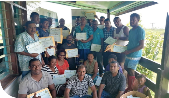
Rice Farmers training at Vunivutu Village in partnership with Ministry of Agriculture, Fiji Rice and UNDP.