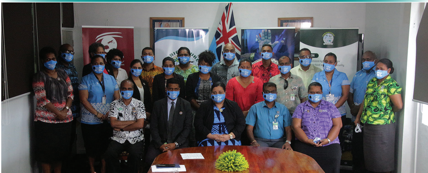
Officials from FICAC and Ministry of Agriculture during the launch of the Anti Bribery Campaign at the Agriculture Headquarters in Raiwaga.

The Ministry of Agriculture has become the first Ministry to join the “I don’t accept bribes campaign currently underway.