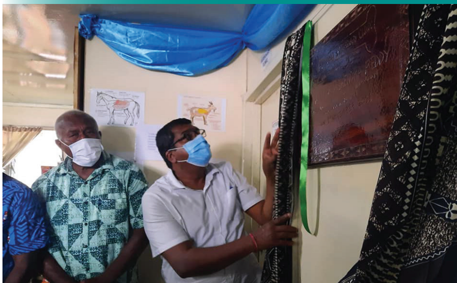
Commissioning of the Vatumali Veterinarian Clinic by the Minister for Agriculture, Waterways and Environment Hon. Dr. Mahendra Reddy.

More than 200 livestock farmers of the upper Sigatoka Valley can now access basic veterinarian services at the Keyasi Government Station, in the highlands of Navosa.