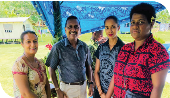
Staff from the North.