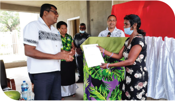
Minister - Hon. Dr. Mahendra Reddy presents Women in Agriculture package to a recipient in the West.