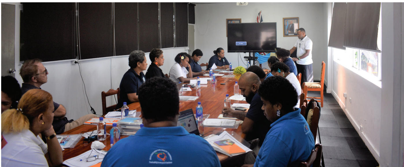
Highlights from the EP&S 1st Quarter Meeting at HQ.

The status of agro tourism and agri business, farm level data and profile, and budget utilization for the Economic Planning and Statistics (EP&S) Division of the Ministry were some areas discussed during the Division's first quarter meeting.