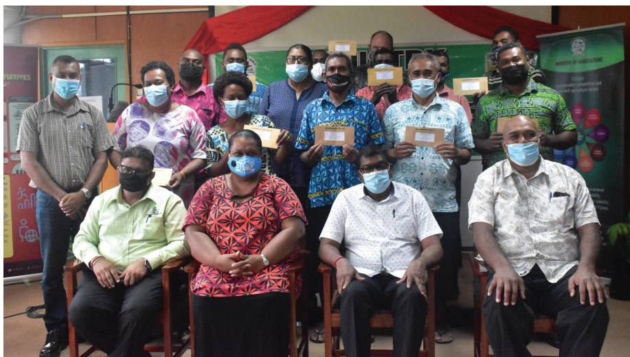
Handing over of the Commercial Agriculture Development programmes at the Commissioner Northern's Office.

Minister for Agriculture, Waterways and Environment Hon. Dr. Mahendra Reddy handed over offer letters to 11 successful recipients of the Ministry of Agriculture's commercial development programmes on 23 November.