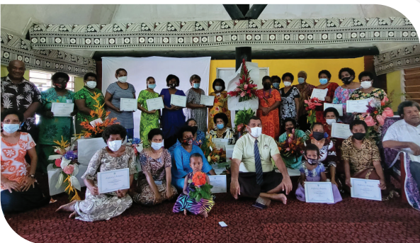
Ministry staff, participants and invited guests of the floriculture training conducted at Burebasaga village.