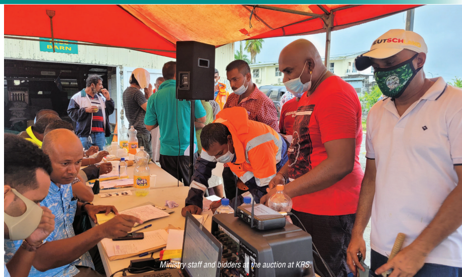
Ministry staff and bidders at the auction at KRS.