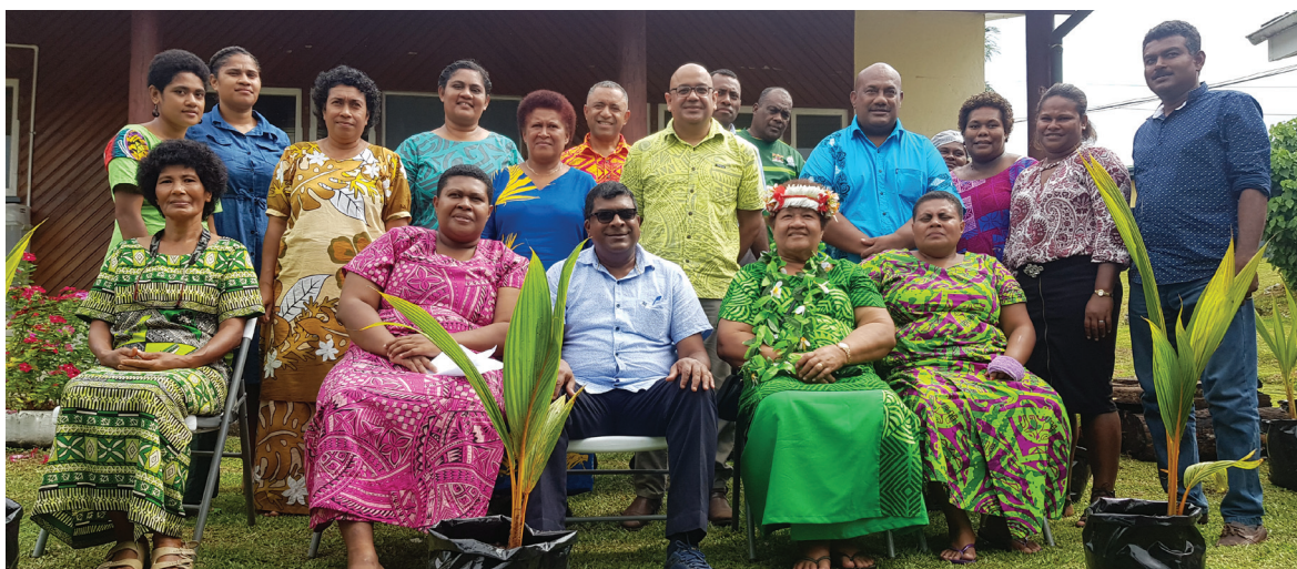
Minister for Agriculture Hon. Dr. Mahendra Reddy and senior Ministry officials with participants of the 12th Coconut Wholenut Processing training after officially handing over their VCO machines

Six women's groups on the island of Taveuni and neighboring Kioa Island received Virgin Coconut Oil (VCO) machines as part of a recently concluded training under the Taveuni Coconut Centre program.